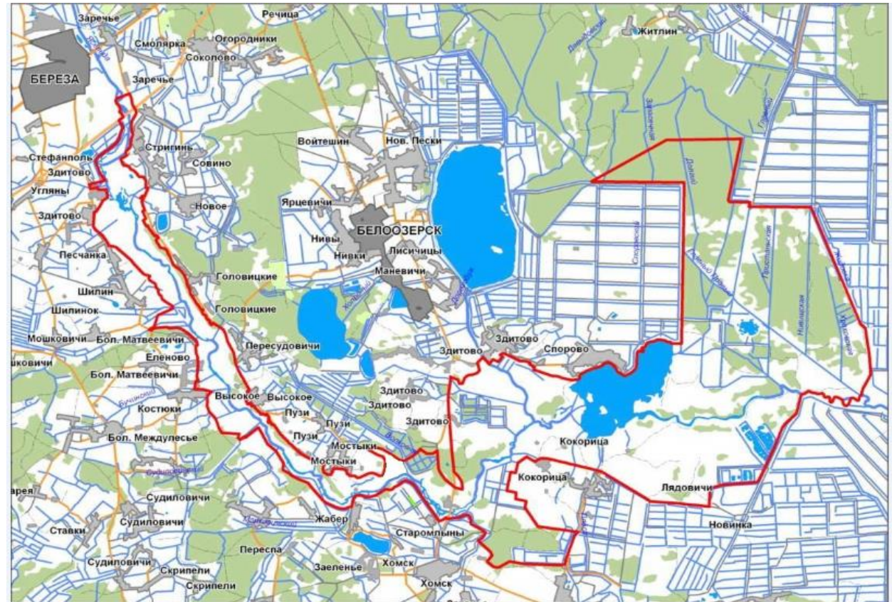
The boundaries and location of the Sporovsky reserve